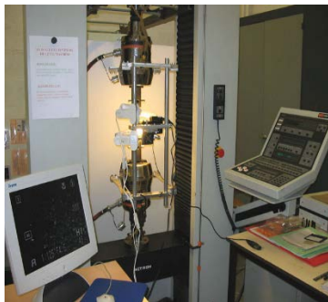
Multi-instrumented mechanical test.